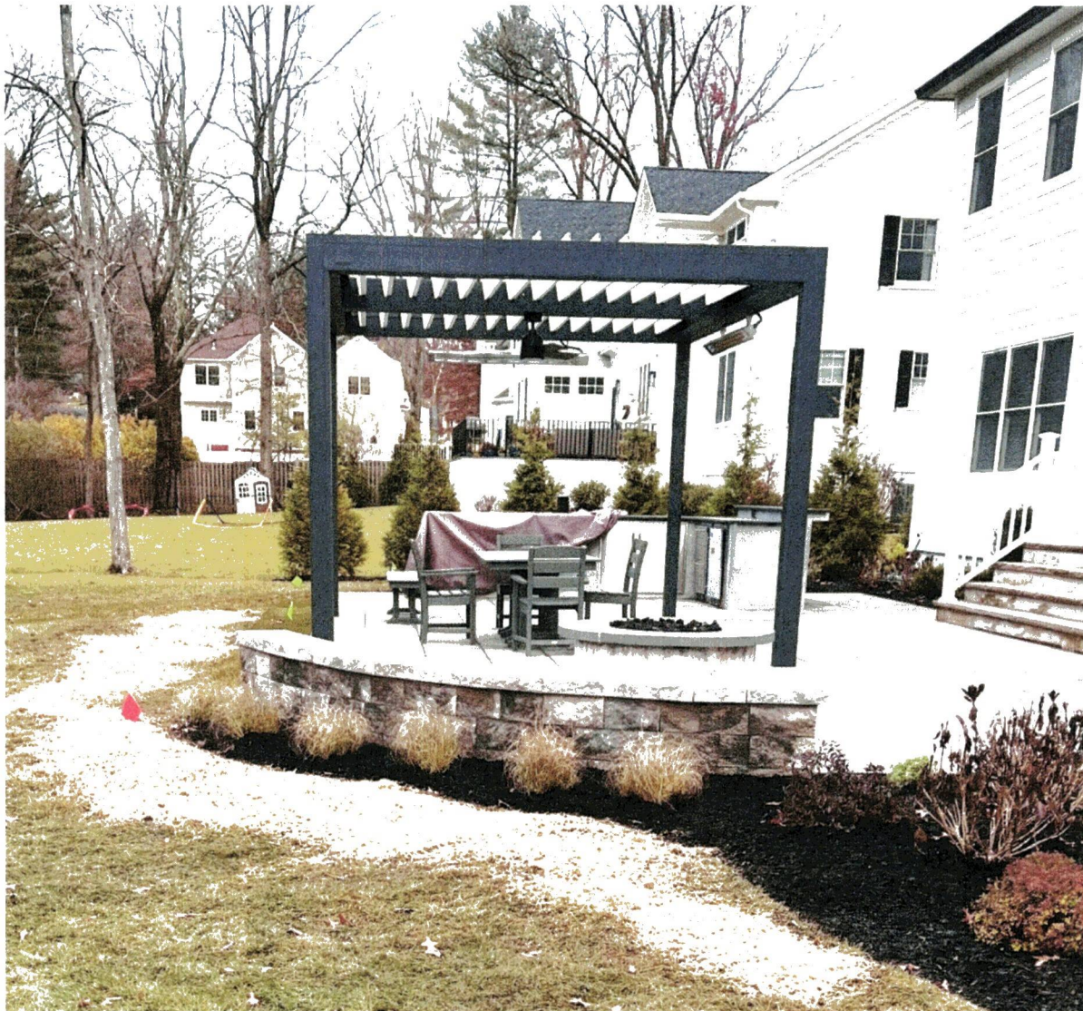
Picture of representative pergola which measures 12' W x 16' L x 9' H