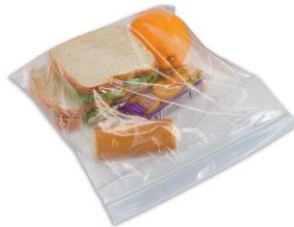
FOOD STORAGE BAGS