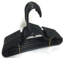
PLASTIC & WIRE HANGERS