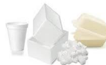
POLYSTYRENE FOOD CONTAINERS